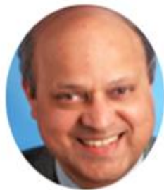
Dr. Ram Vascular & Health Index